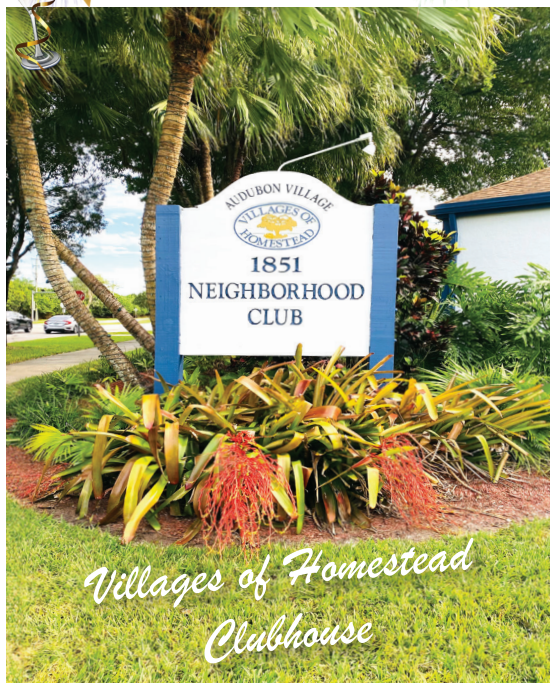
Villages of Homestead Clubhouse