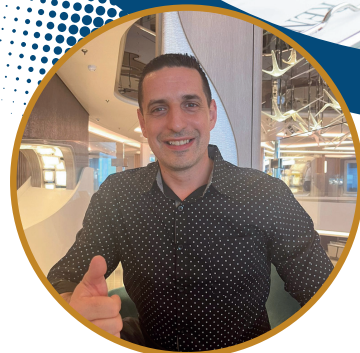
HI, I'M YOUR FRIENDLY NEIGHBORHOOD LOAN OFFICER.