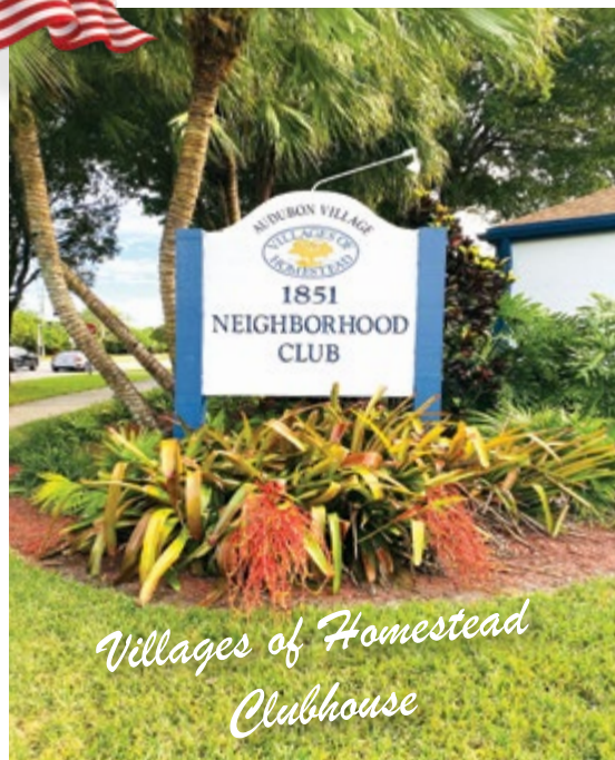
Villages of Homestead Clubhouse